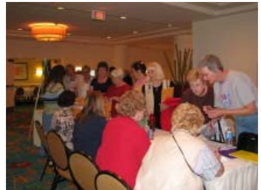
The busy registration table Friday.