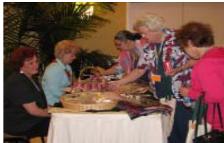
Pilots enjoy shopping at the conveniently located Marketplace.