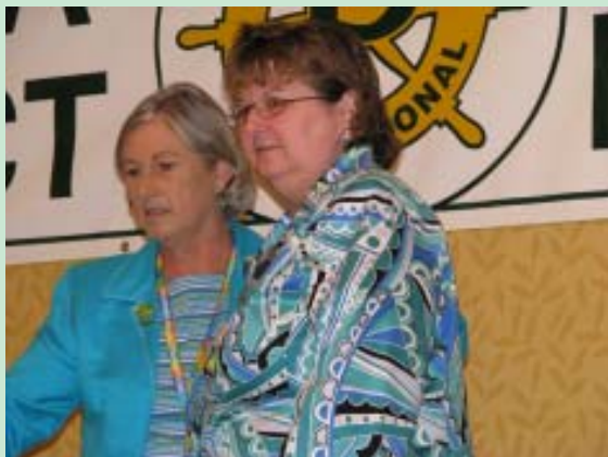
Banners and Pins Are Exchanged